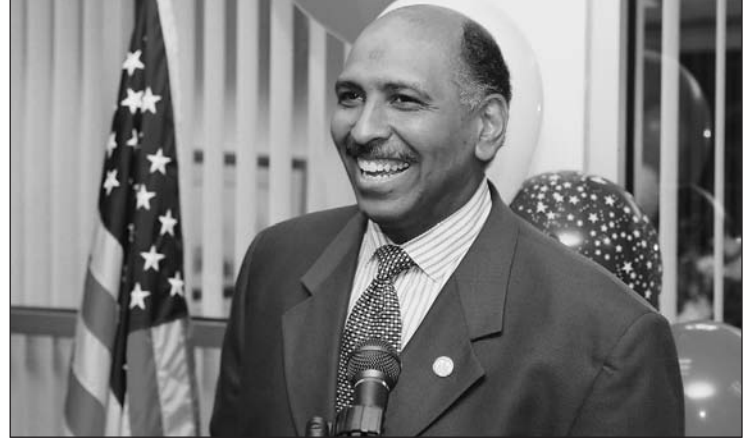
Lt. Gov. Michael Steele at the podium.