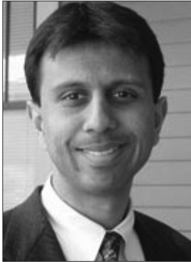
Gov. Bobby Jindal (Louisiana)

While NCCF normally doesn't involve itself in state elections, it's worth noting that two outstanding conservatives were elected to the governorships of their respective states in 2007. In particular, the election of Indian-American Congressman BOBBY JINDAL (who was aided by NCCF in his Congressional campaigns) as Governor of Louisiana was a major victory for the conservative movement. Just 36, Jindal should enjoy a long career in public service and is considered a rising star in conservative Republican circles. He ran on a reformist platform to end corruption, mismanagement, and waste in state government. Meanwhile, next door in Mississippi, incumbent Gov. HALEY BARBOUR was re-elected to a second term. A one-time Chairman of the Republican National Committee, Barbour won high marks for his handling of Mississippi's recovery in the aftermath of Hurricane Katrina and for promoting growth-oriented policies in his state while opposing tax hikes and unnecessary state spending.