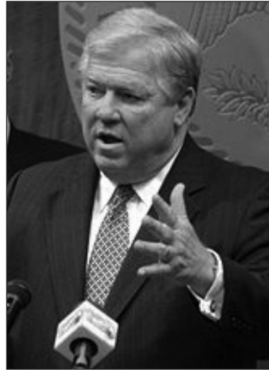
Gov. Haley Barbour (Mississippi)