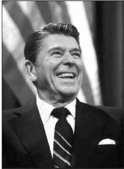
Ronald Reagan Presidential Foundation